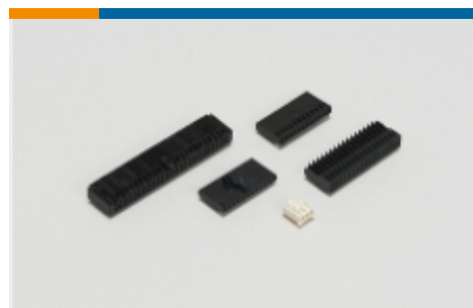
Wire-to-Board Connector Assemblies & Housings(5)